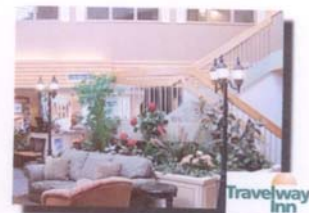
TRAVELWAY INN Tel: 705-522-1122 Toll Free: 1-800-461-4883 www.travelwayinnsudbury.com 1200 Paris Street