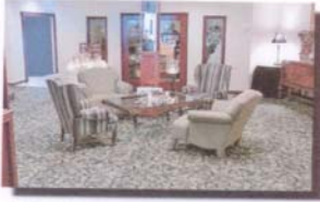
AMBASSADOR HOTEL Tel: 705-566-3601 Toll Free: 1-800-859-4442 www.ambassadorhotel.ca 225 Falconbridge Road

Please make your hotel/motel reservations early if you are planning to visit your camper for the weekend. Here are some suggestions:-