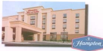
HAMPTON INN Tel: 705-523-5200 Toll Free: 1-800-HAMPTON www.sudburyontario.hamptoninn.com 2280 Regent St. South