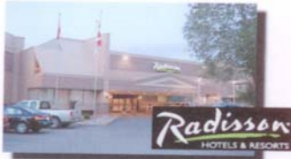
RADISSON Tel: 705-675-1123 Toll Free: 1-800-333-3333 www.radisson.com/sudbury.ca 85 Ste. Anne Rad