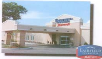
FAIRFIELD INN & SUITES Tel: 705-560-0111 Toll Free: 1-888-236-2427 www.marriott.com 490 Barrydowne Road